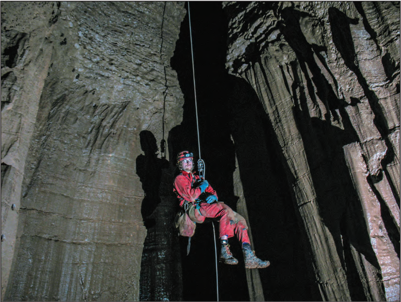
A caver completing a 120-foot drop, Bland County, VA.