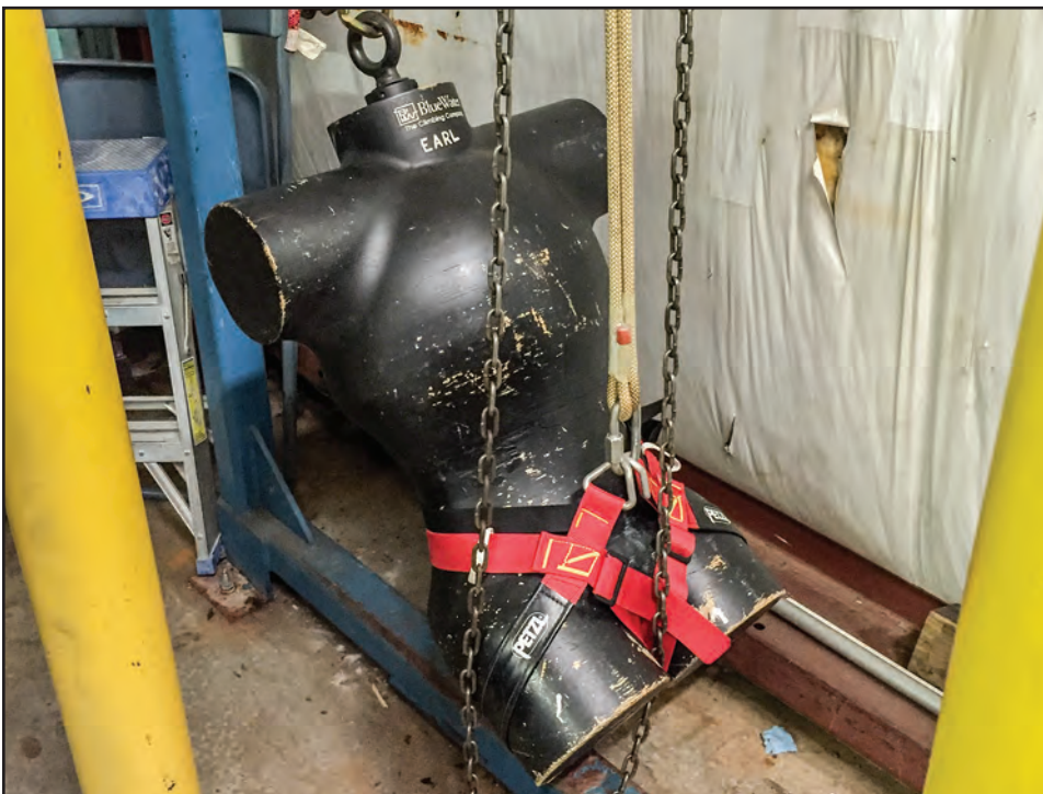
Figure 6—A dummy and test apparatus setup ready for a harness pull test.

As a secondary test, we asked BlueWater Ropes to test the harnesses to failure. BlueWater Ropes could not test to failure. They retested harnesses using the same criteria as earlier tests, but they applied increasing weight loads to a maximum of about 5,000 lbf, the limits of their testing machine.