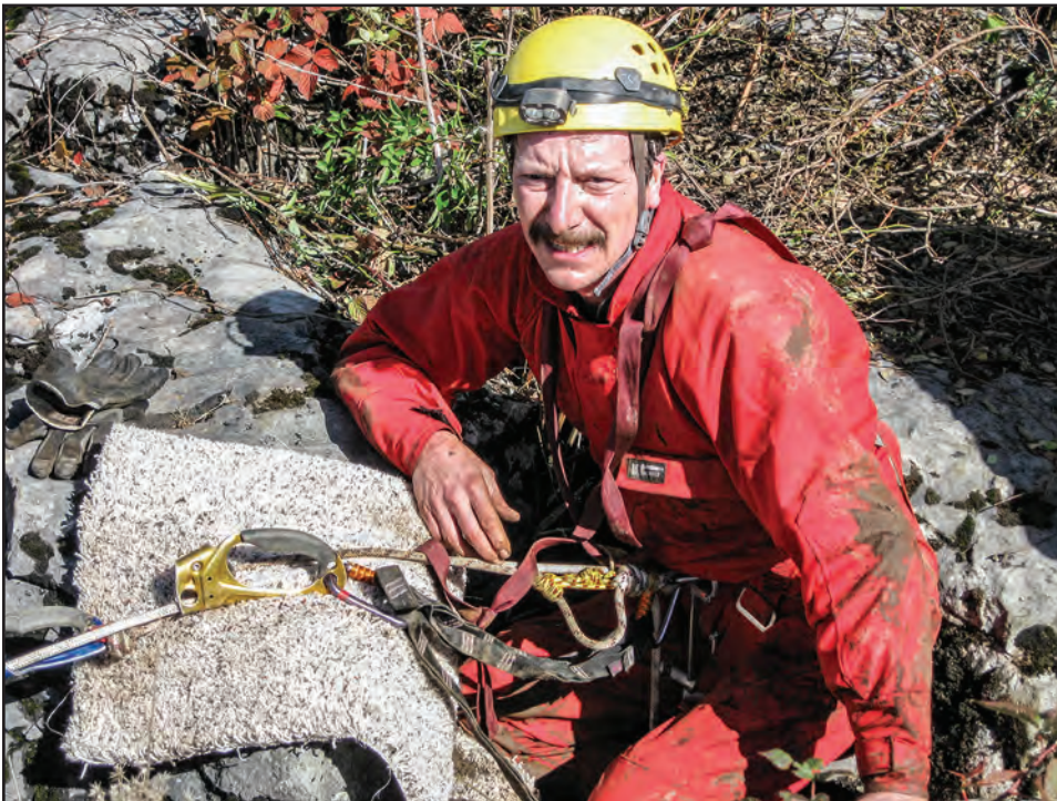
Figure 1—A caver using climbing rope and harness equipment, Grant County, WV.

Agriculture, Forest Service, National Technology and Development Program (NTDP), tested the effects of this method, as prescribed in the current “National White-Nose Syndrome Decontamination Protocol—Version 4.12.2016,” on the strength of selected ropes and harnesses. Test results indicated that treated rope samples had about 0.2 percent to 2.0 percent less strength than untreated ropes. Tests showed that all of the treated ropes had actual breaking strengths well above the minimum breaking strength advertised by the rope manufacturer. All harnesses (treated and untreated) passed the 3,372 pound-force (lbf) test (European Standard EN 12277). There was no evidence that the decontamination procedure affected the performance of the harnesses.