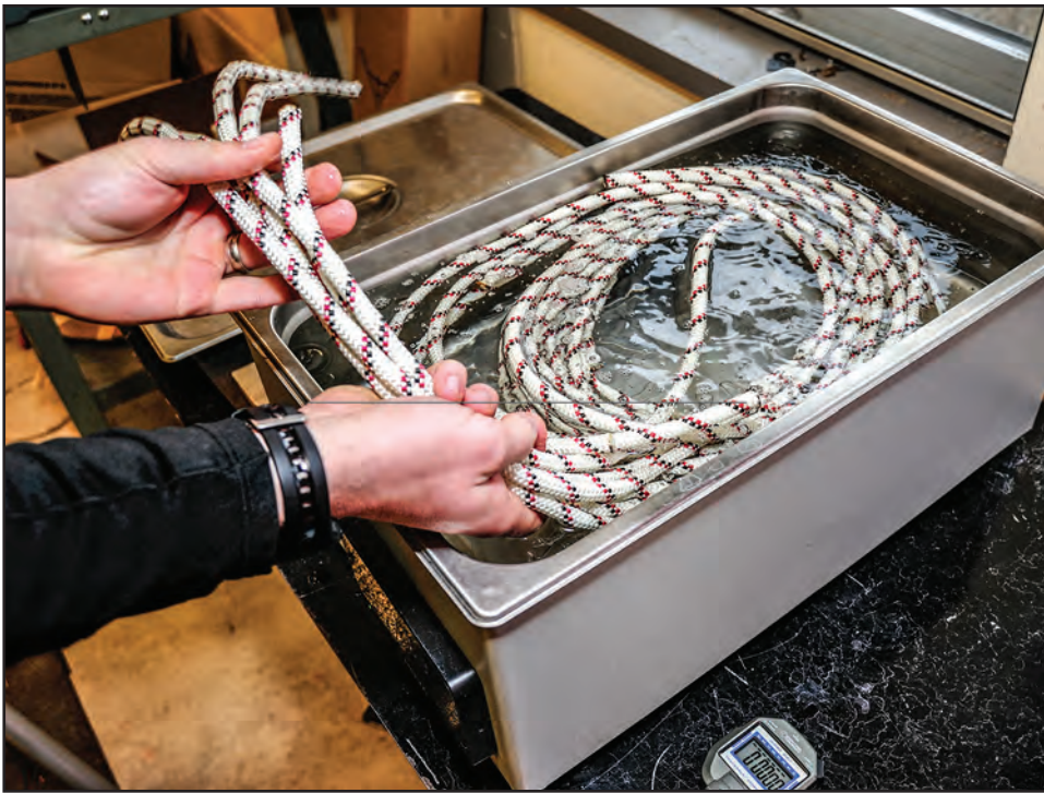
Figure 2—The National Technology and Development Program (NTDP) applied the decontamination protocol to half of the test equipment samples. NTDP soaked the samples in a 55 °C waterbath for 20 minutes or longer.