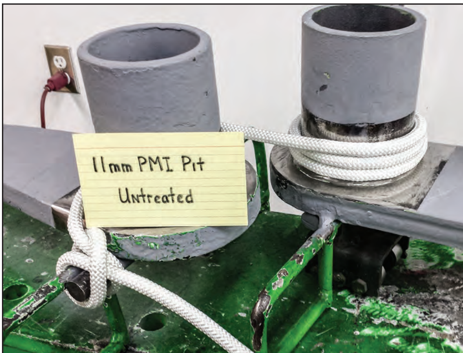
Figure 4—Holloway Houston, Inc., pull-tested rope samples until the samples broke.

NTDP sent the rope samples to Holloway Houston, Inc., for strength testing. They recorded rope strength and elongation data as a test machine pulled the rope samples (figures 4 and 5). The machine pulled each sample until it broke. Holloway Houston, Inc., tested in accordance with the requirements of the minimum breaking strength test of Cordage Institute CI-1801 (2007: Section 9.2).