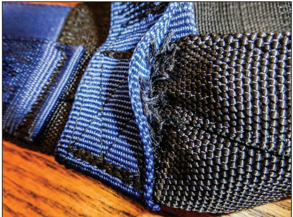
Figure 8—Some seam failures occurred during the 5,000 pound-force test.