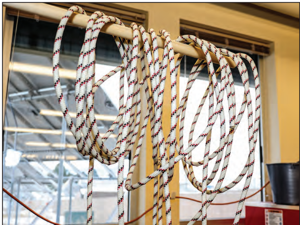
Figure 3—The National Technology and Development Program allowed the treated samples to air dry overnight.