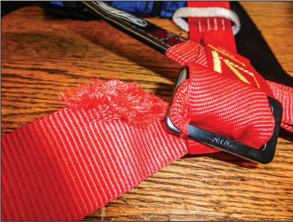
Figure 7—Some webbing failures occurred during the 5,000 pound-force test.