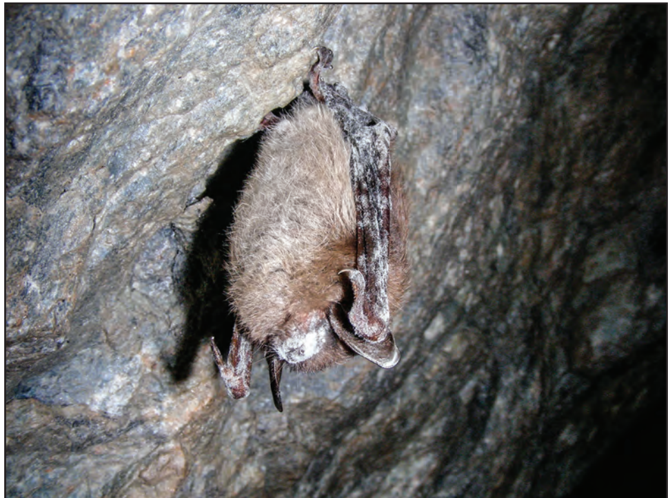
A little brown bat with white-nose syndrome, Windsor County, VT.

Decontaminating caving gear is important for reducing the spread of pathogens such as the fungus that causes white-nose syndrome in bats. The U.S. Department of Agriculture, Forest Service, National Technology and Development Program (NTDP), evaluated the effect of the current decontamination protocol on the strength of popular models of ropes and harnesses. The decontamination procedure had minimal effects on the strength of ropes or harnesses that NTDP tested.